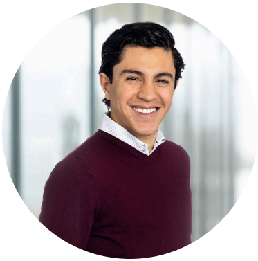
Eduardo Espinosa de los Monteros Pereda